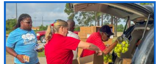
Commodities Distribution in May

The department also distributed 350 school supply bags at back-to-school events , continuing its commitment to supporting families and vulnerable residents.