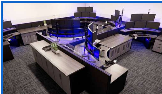
Rendering of the future joint call center facility

A major 2025 accomplishment was securing approval for a new joint 911 call center for parish and sheriff dispatchers — a $1.5 million project supported by a $500,000 grant. Construction began November 17, with completion expected in 2026.