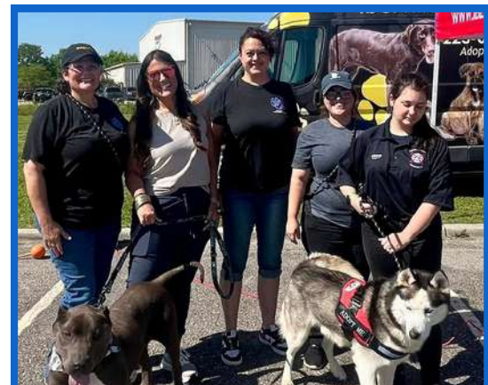
Members of the Animal Control team at the Adoption Event and Pet Expo in St. Gabriel

Volunteers, fosters, donors, and the new Iberville Rescue Run Club played a vital role in this success. The shelter also received $385,040 in in-kind support, including medications, vaccines, and supplies from Save A Heart, Pet Pharma, and Greater Good Charities.