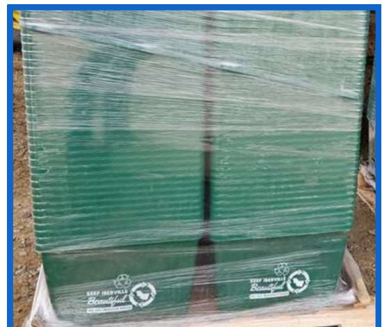
Household recycling bins that will be available for distribution in 2026

In addition, all curbside trash cans will be replaced in 2026 to create a uniform look aligned with the Keep Iberville Beautiful initiative.