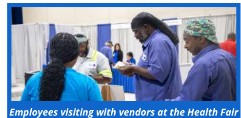
Employees visiting with vendors at the Health Fair

In 2025, the department expanded safety and professional development with specialized Public Works training, parishwide CPR/AED/Stop the Bleed sessions, and a retirement planning seminar. HR also launched two major events — the Employee Health & Wellness Expo and the Employee Benefits Fair — giving employees greater access to resources and support.