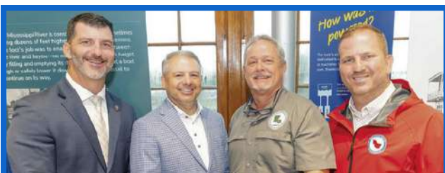
President Chris Daigle and local leaders celebrated the grand re-opening of the Plaquemine Locks

Tourism also advanced key attractions: the Plaquemine Lock completed phase one of its restoration with a new exhibit — supported in part by a $250,000 parish contribution — and was designated an official Interpretive Center on America's Great River Road, while the Iberville Museum prepared for a full renovation set to begin in 2026.