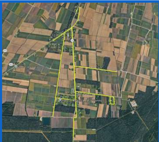
A map of the planned project for the replacement of the Natural Gas system in White Castle