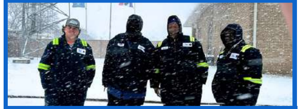
Employees working through Historic Snowfall Event

The team also led major infrastructure projects across the parish, advanced critical drainage improvements in Ivory Swamp and at the Bayou Plaquemine Locks to reduce flood risk, and completed the LA 1 Beautification Project, enhancing a key corridor and creating a more welcoming gateway for residents and visitors.