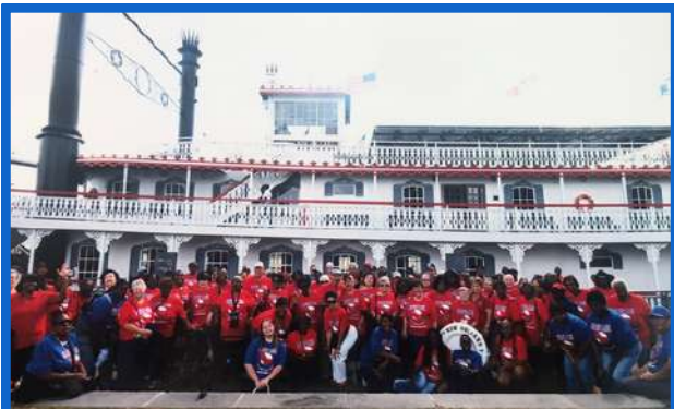
Council on Aging members enjoying their day on the Riverboat in New Orleans

Along with annual events like the Spring Fish Fry and Thanksgiving Luncheon, the Council expanded its offerings in 2025, including a new Mississippi Riverboat Cruise enjoyed by more than 100 seniors — an experience they can't wait to repeat.