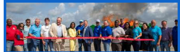
Ribbon Cutting of the Air Curtain Incinerator

The Economic Development and Environmental Department advanced key initiatives, including securing an Air Curtain Incinerator with LDEQ permitting to improve vegetative waste management. The team also worked with LED and local landowners to move new properties toward Site Certification .