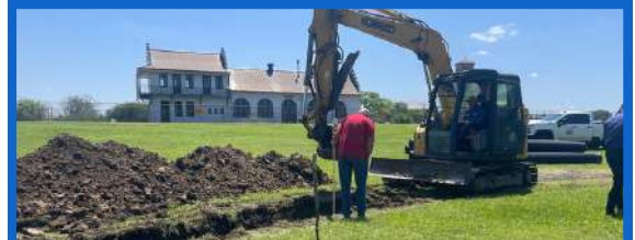
Bayou Plaquemine Locks Drainage Improvement