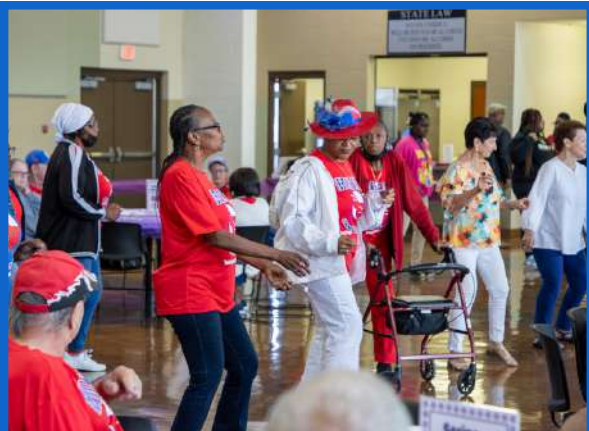
Council on Aging Fish Fry at the North Iberville Community Center