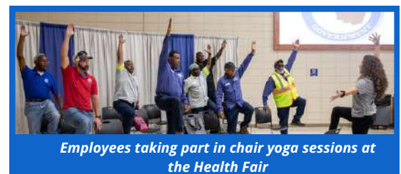
Employees taking part in chair yoga sessions at the Health Fair