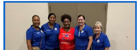
Giving out school supplies at the IPSB Back to School event in July