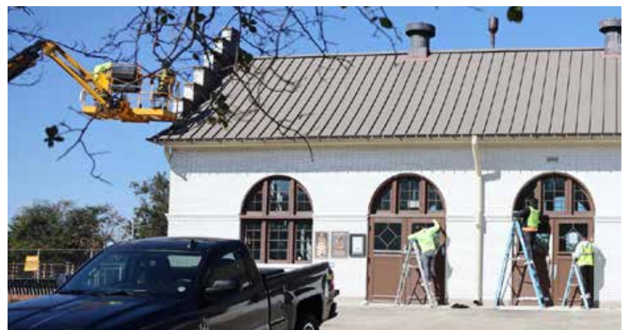
Exterior work includes waterproofing the building, painting and repair of glazed tile.

Phase II includes upgrades to the boathouse and grounds, and additional grounds signage and new exhibits. That phase is expected to begin by the Spring of 2025. The Friends of the Plaquemine Lock organization is directing the $1 million dollar project.