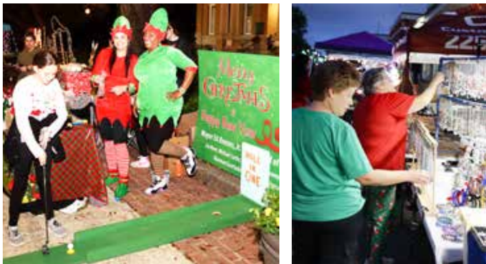
The All Is Bright Christmas event drew a big crowd downtown on Dec. 14. Shown are scenes from the event.