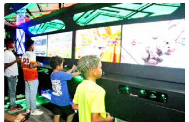
Fall Festival fun for the kids!