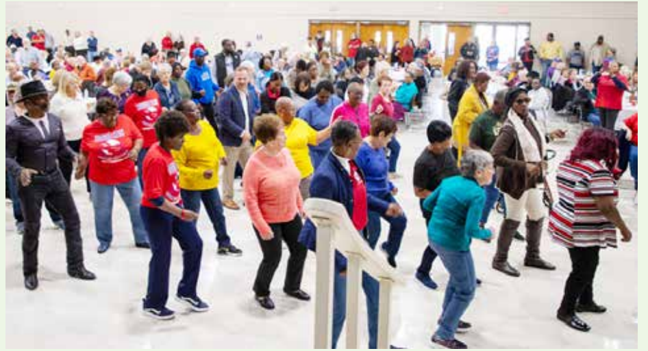
Seniors enjoy a line dance during the Thanksgiving Luncheon.

A special thank you goes out to our Council on Aging employees for their hard work and dedication in putting this event together. We also extend heartfelt gratitude to Westlake Chemical, COA board members, local officials, parish employees, and the dedicated volunteers who made this event a tremendous success. Your contributions made a difference in creating a memorable day for our seniors!