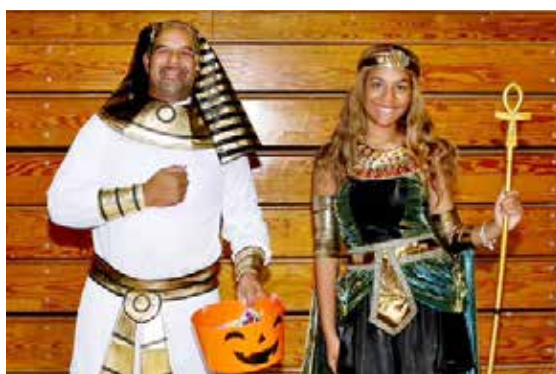
Dressed for the Ghostly Get-Together.