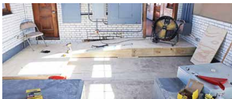
A handicapped ramp is added for handicapped access in the building.