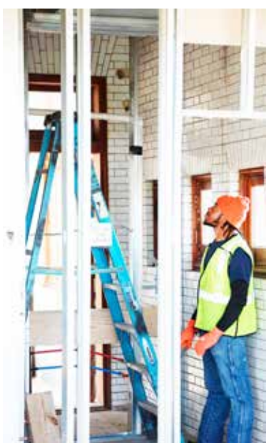
A new ADA accessible restroom is being added.