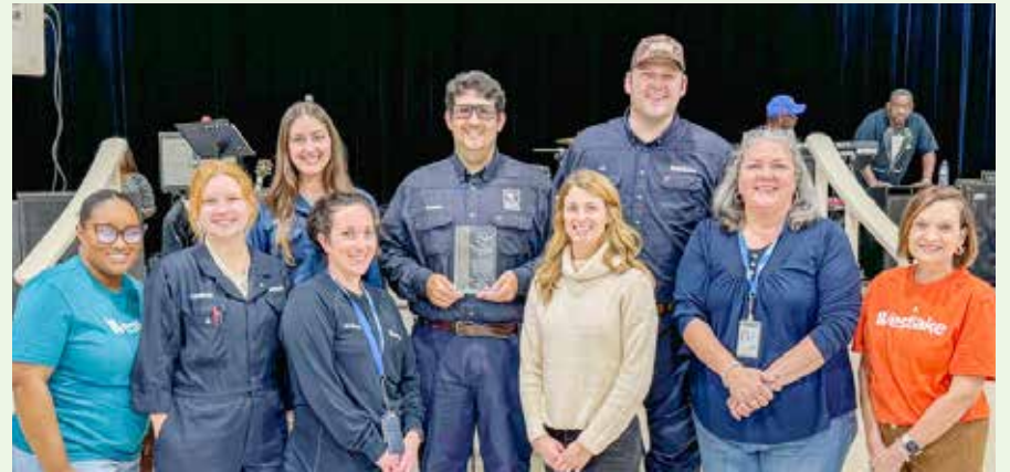
Members of the Westlake team accepting a plaque in appreciation for sponsoring the luncheon.