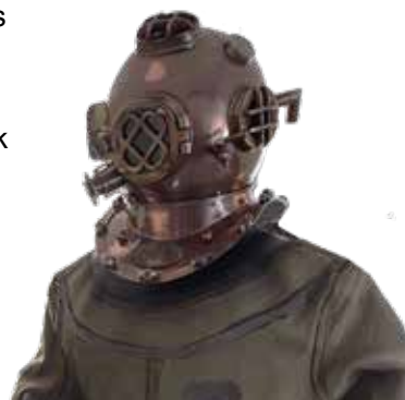
At left, operational boat wheel from a 1920s steamboat. Above, portion of the 1940s diving suit used by divers to go to the bottom of the lock. Both are parts of the new exhibit.