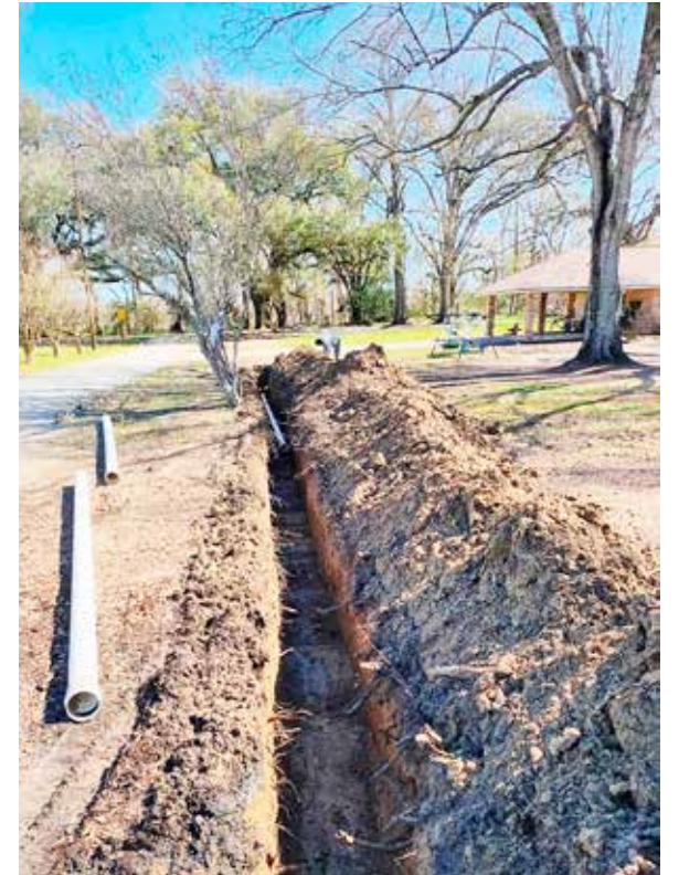
Shown are photos of the water line upgrade project when it was underway.