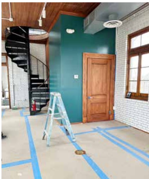
A portion of the new Lockhouse welcome room.

Phase II includes upgrades to the boathouse, site drainage improvements and new exhibits to show off the 13 historic boats in the boathouse. The Friends of the Plaquemine Lock organization is directing the $1.1 million dollar project.