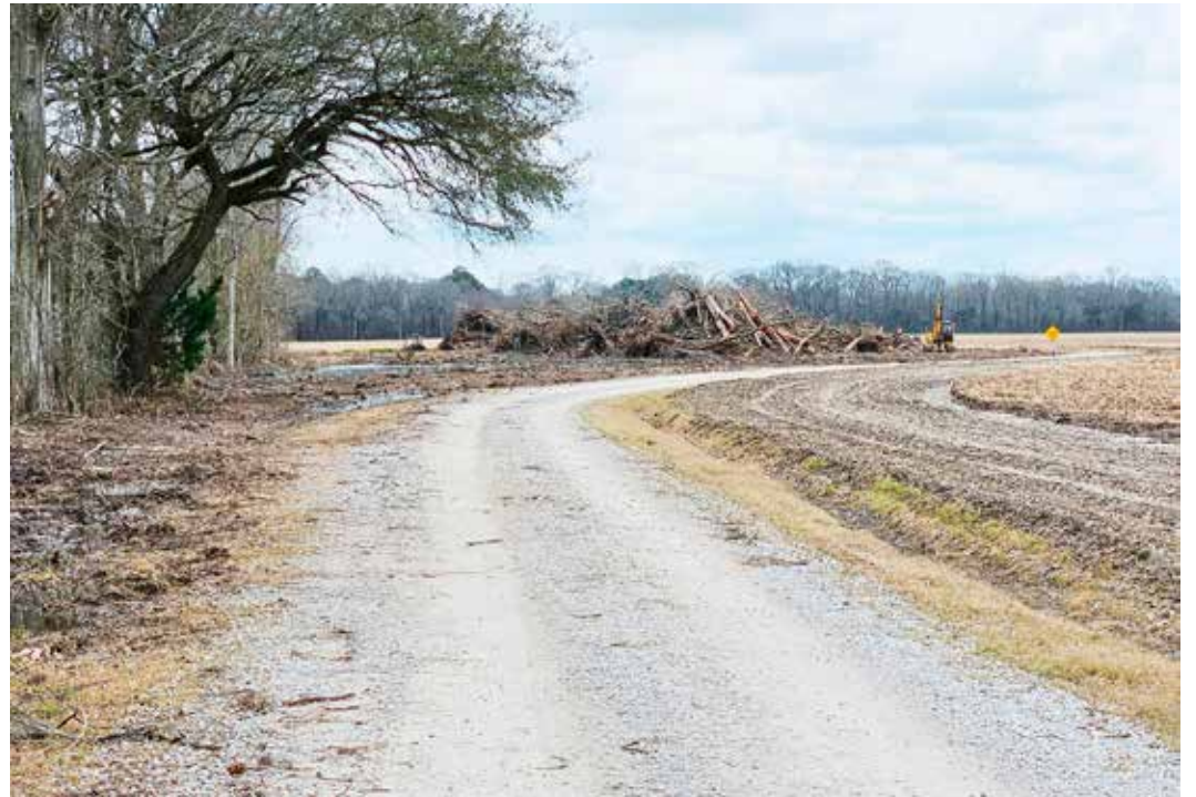
A portion of the gravel road that will become Hwy. 77 by-pass. Shown at back is a pile of trees and vegetation that has been removed to make way for the 2-lane highway.