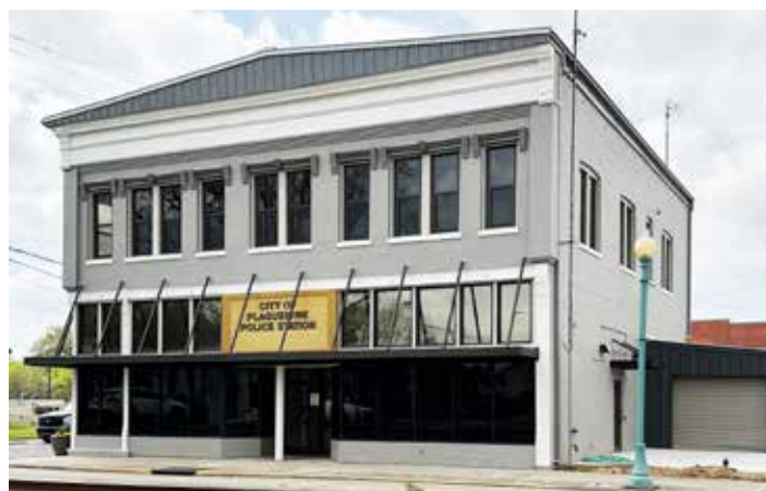
Police Station repainting underway.