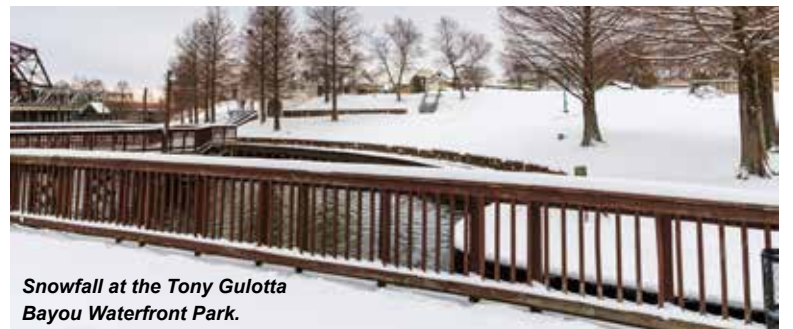
Snowfall at the Tony Gulotta Bayou Waterfront Park.

"It was a joy to watch our families play in the snow and enjoy the historic snowfall, and I was able to do that because our crews worked hard to take care of residents. My thanks to them for a job well done."