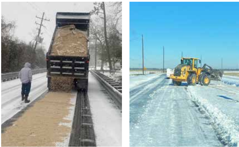
Parish workers dumped sand on bridges before and during the big snow event in January. After the snowfall ended, dump trucks were used to move inches of snow from roadways.