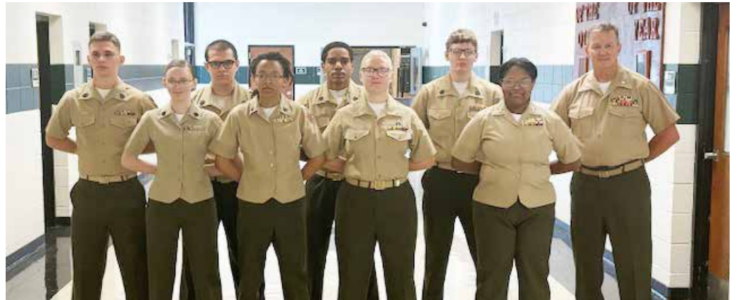
Some of the cadets in the Plaquemine High Marine Corps Jr. ROTC program are shown in the photos above.